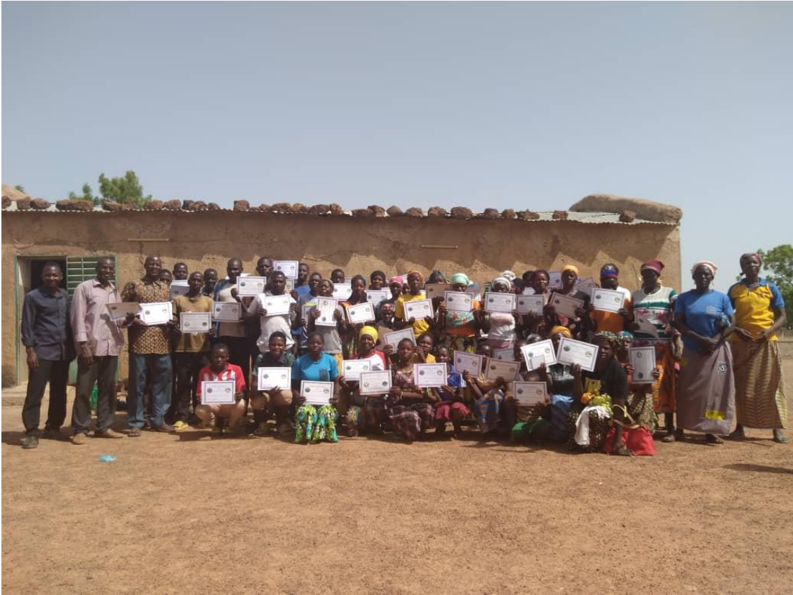
In the past month we have done four different trainings for Foundation for Farming in our community.