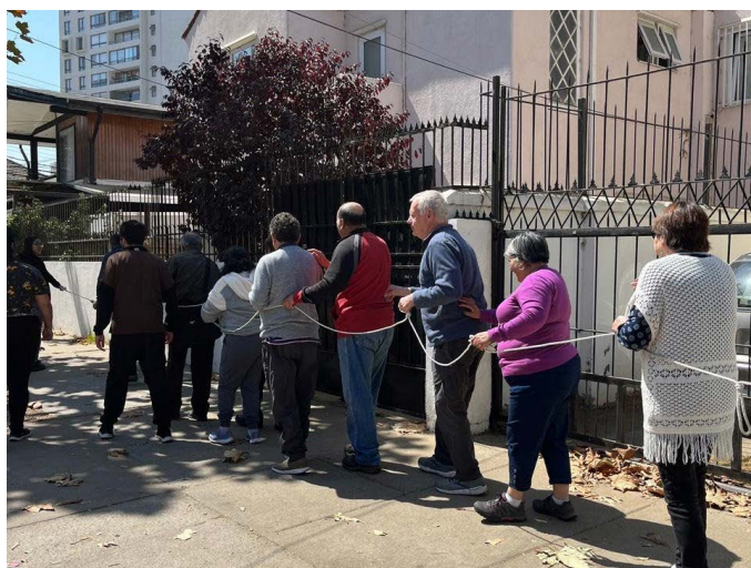
Earthquake drill at CEMIPRE

We have been offered a matching fund challenge which would allow us to employ an executive director whose main focus would be to discover financial support locally so CEMIPRE can become self-sustaining. We are currently at 32% of the funds needed to meet that goal. Please consider giving a one-time gift to help us get those funds before the November deadline. Thank you all!